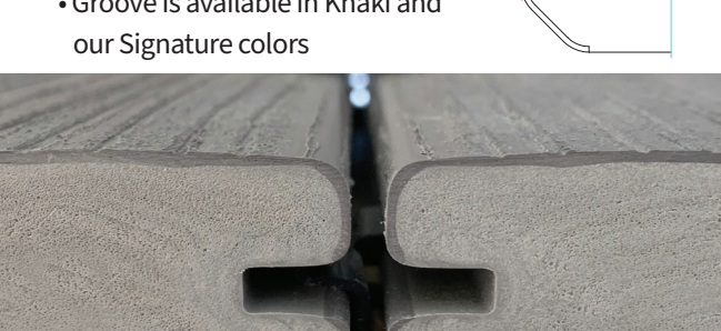
Photo shows an installation using a hidden fastener system. Ask your VEKAdeck representative about recommended hidden fastener systems.